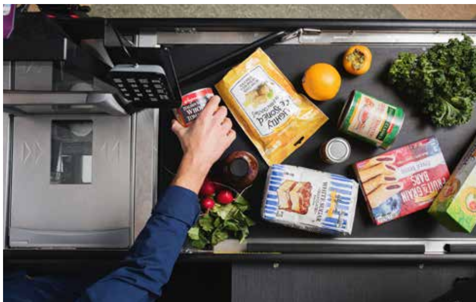
Deploying the near-imperceptible Digimarc Barcode technology at supermarket self-checkout aisles expedites the whole process by virtue of not having to manipulate the package in order for the scanner to read the UPC code, resulting in shorter lineups and happier shoppers.